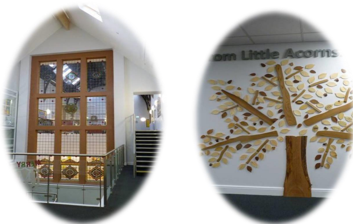
The impressive stained glass window and Legacy Tree in the foyer

The priorities for all schools in South Lanarkshire are set out on the back page of the handbook.